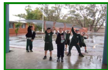
The Boy's stack the steel away