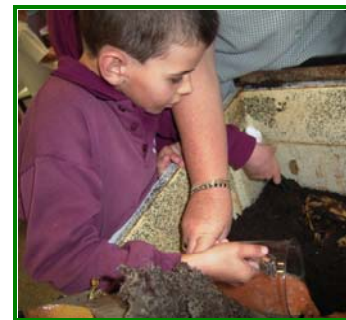
Feeding the Worms